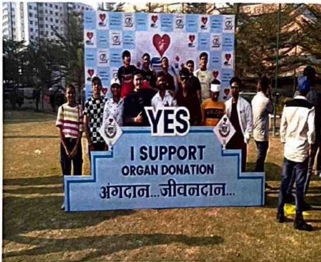
Oath taking for Organ Donation