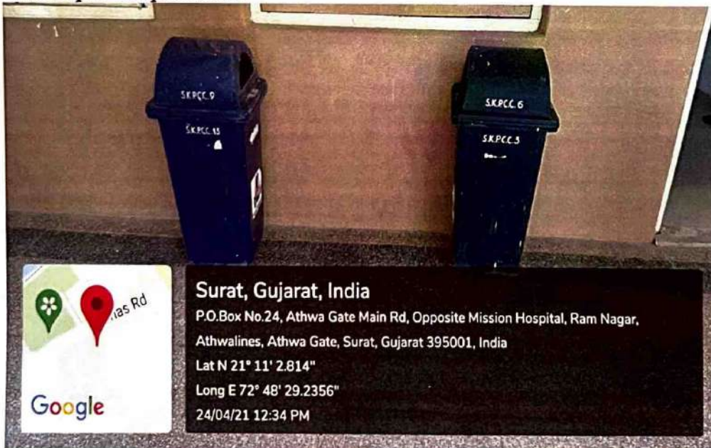
Dry and Wet Dustbins

(b) Facilities for the management of degradable and non-degradable waste: Entire campus is provided with Dry and wet dustbins and later on the waste is collected by Surat Municipal Corporation.