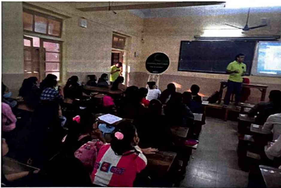
Seminar- Use and Benefits of Organic Products