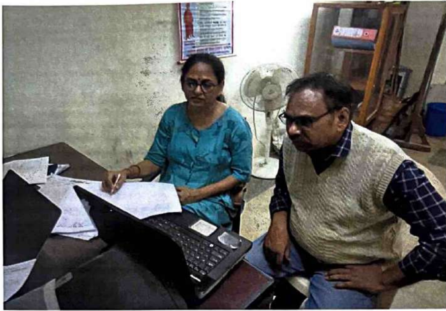
Online Debate Competition - 'Save Water'