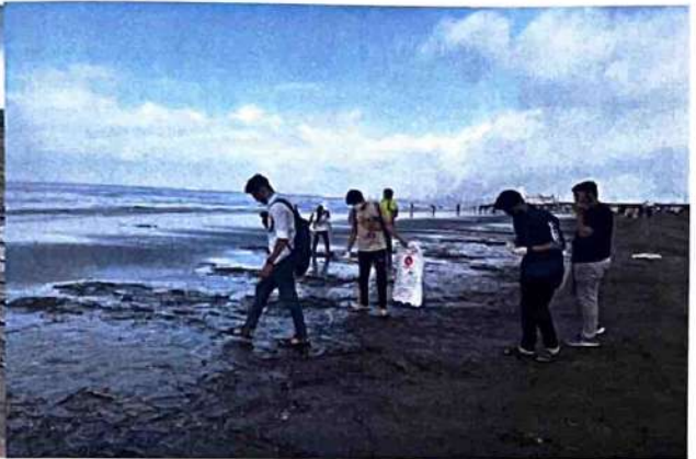
Cleaning the Dumas Beach