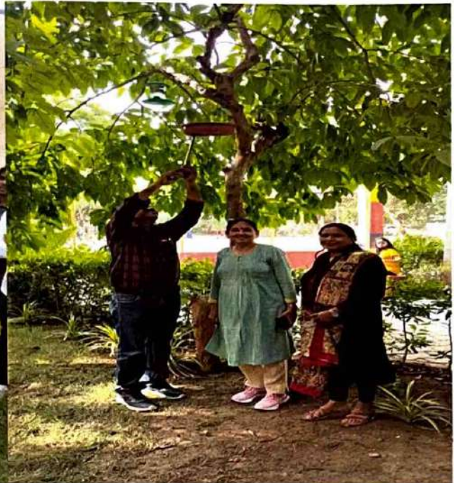
Filling water in a pot for Birds