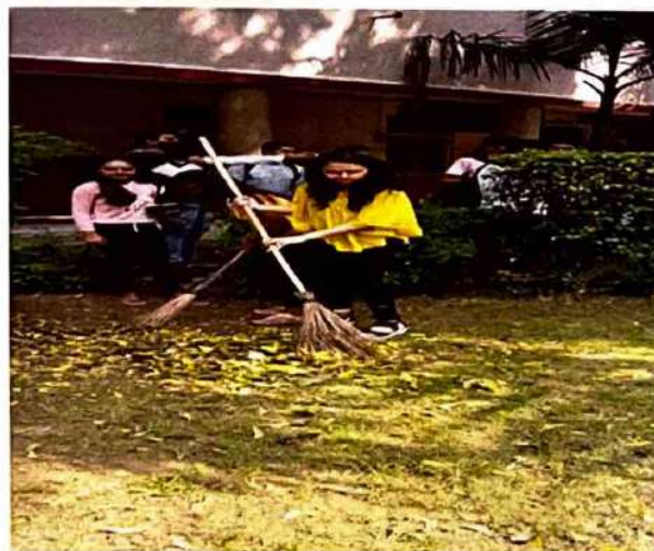
Cleanliness Drive on the Campus