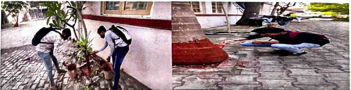
Applying Geru to save the trees from Fungus