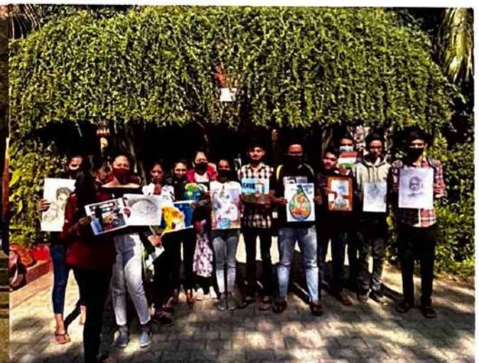
Poster making Competition "Save Girls, Save Earth"